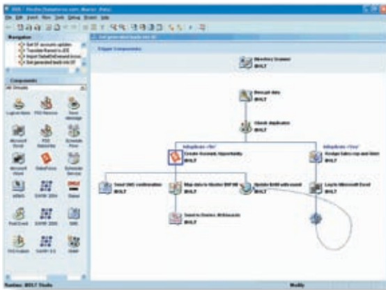
iBOLT's Business Flow Editor allows you to easily and intuitively drag, drop and configure your business processes